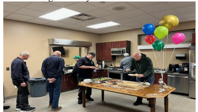
Lakeshore Fire Department Kitchen