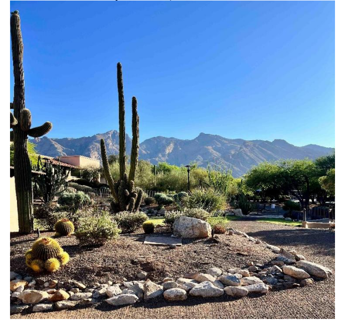
Mountains and Cacti in Tucson

Overall, Tucson was a positive experience for me. I'm glad that I went and I'm honored to have represented Classis Rochester at the national level of church government. Now I'm happy that I've returned to Lakeview Community Church. It's good to be back home. I missed you! Find out more about RCA General Synod: <u>https://www.rca.org/synod/</u> (Bonus points if you can find me in one of the pictures).