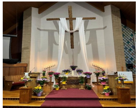
Flowers decorate Lakeview's Sanctuary on Easter Sunday, April 5, 2026