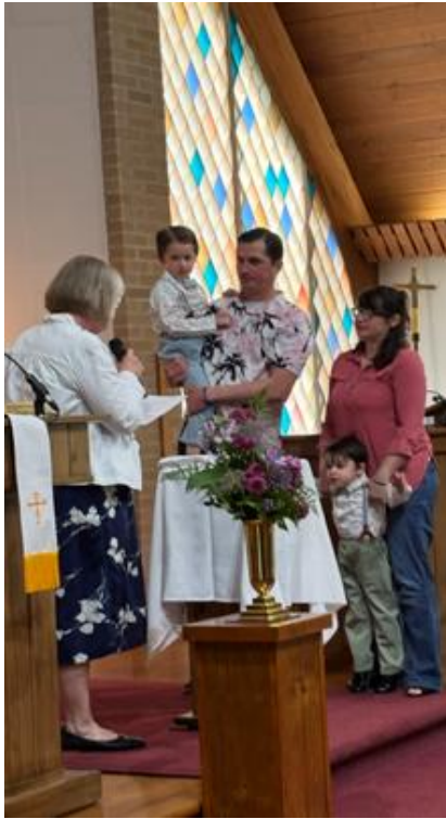
Picture of Baptism on May 31, 2026